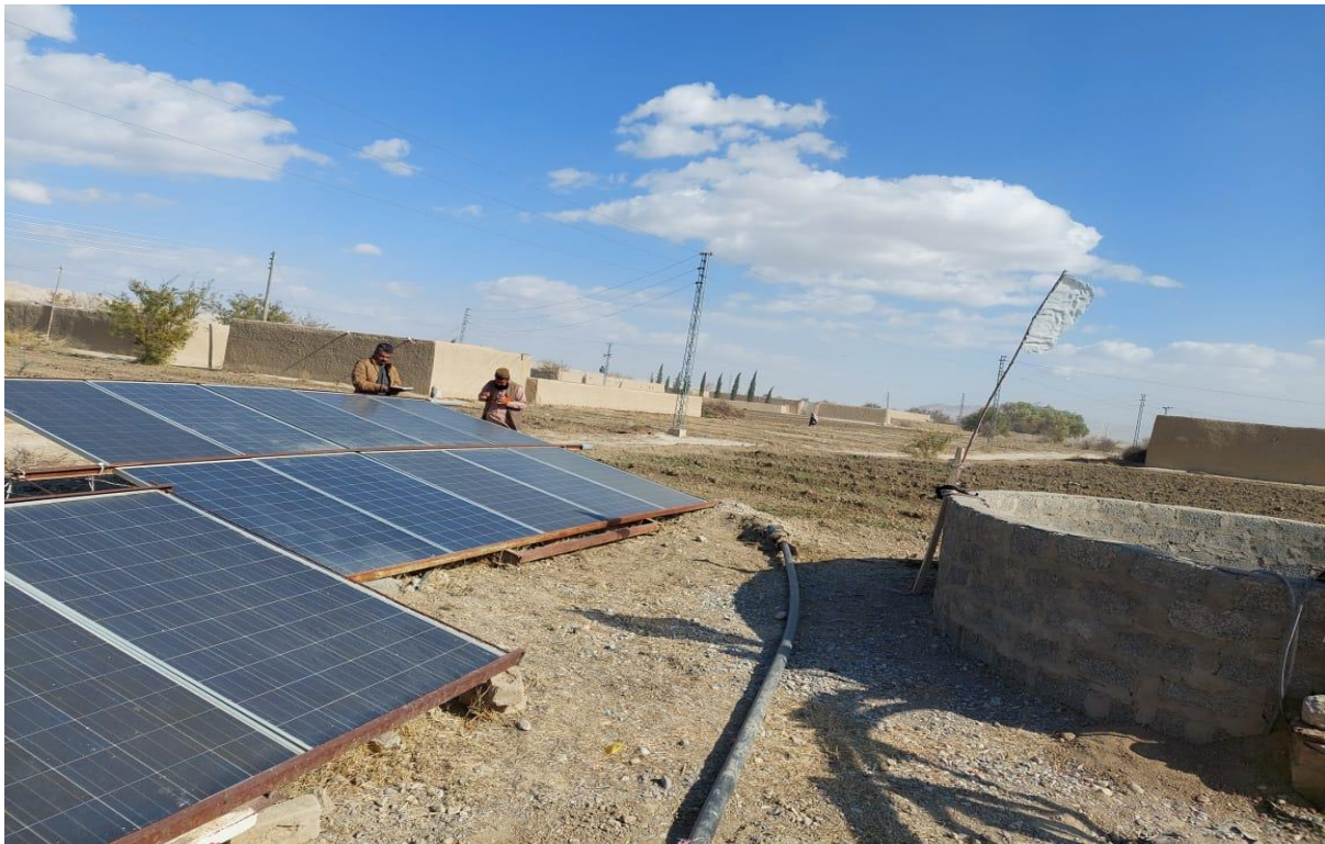
Figure 2: Field visit of Baluchistan during the month of December 2023