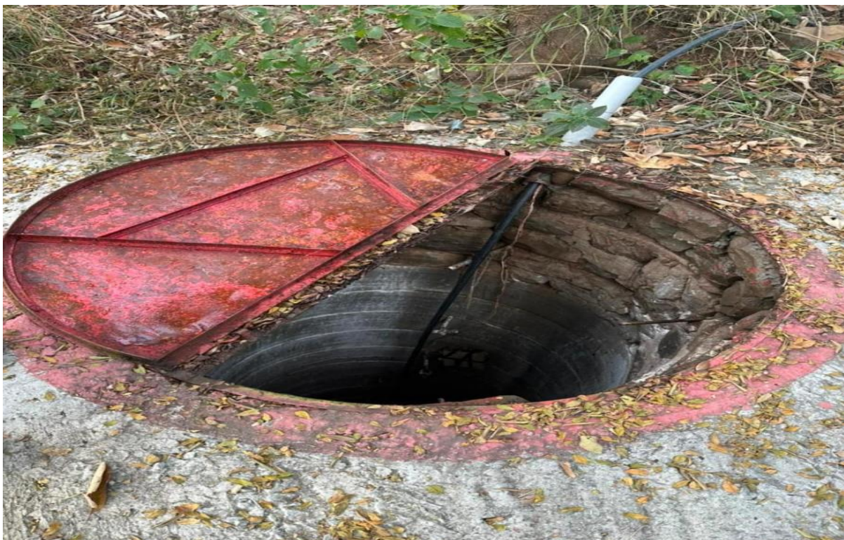
Figure 4: Field Visits of the Islamabad Capital Territory during the month of December 2023