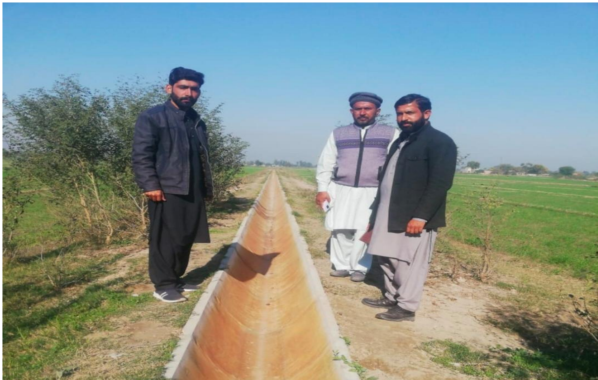
Figure 1: Field visit of Punjab during the month of December 2023