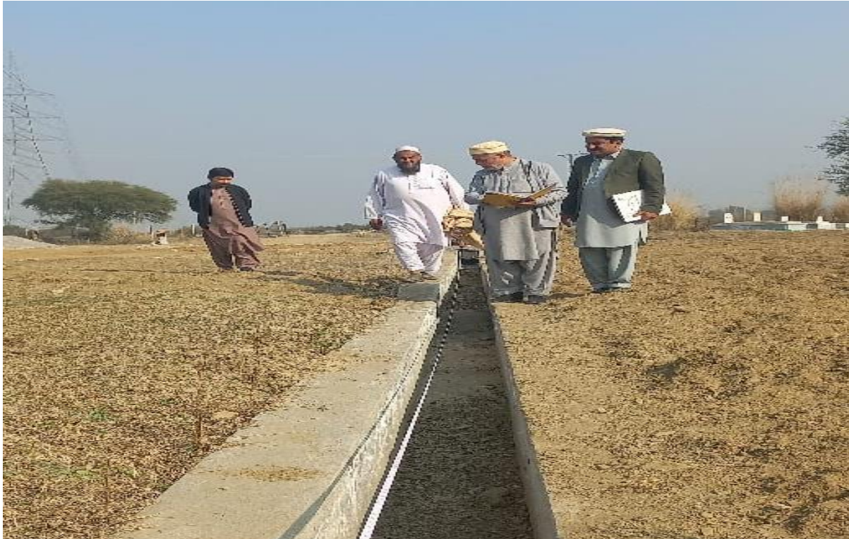
Figure 3: Field visit of Khyber Pakhtunkhwa during the month of December 2023